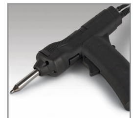
MFR-H5-DS - Pistol configuration