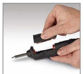
Fast collection chamber replacement