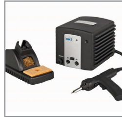
MFR-1350 Desolder System