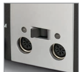
Dual Switchable Output

For further information on the MFR-1300 go to: www.okinternational.com