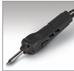
MFR-H5-DS - Pencil configuration