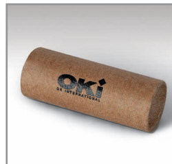
MFR-DC10 - Collection Chamber