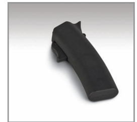
Grip supplied with MFR-H5-DS