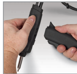
Grip easily clip-on to pencil