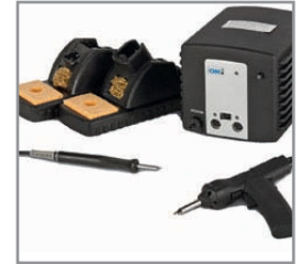
MFR-1351 Desolder & Solder System