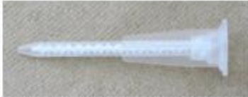
"D" Style 1:1 & 2:1 mix ratio Item # 1334299 (100 pk.)