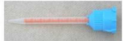
"S" Style 10:1 mix ratio Item # 1329200 (100 pk.)

Checkout pricing and all the features at our Equipment Web Site