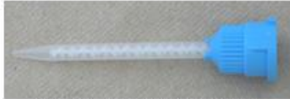
"S" Style 1:1 & 2:1 mix ratio Item # 1440017 (100 pk.)