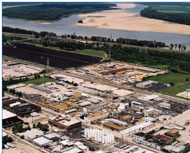
ELANTAS PDG, Inc. headquarters in St. Louis, Missouri

ELANTAS Electrical Insulation companies are strategically located throughout the world to meet the primary insulation, secondary insulation and electronic and engineering materials needs of our customers.