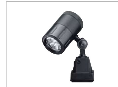
SPOT LED 003 PIVOTING HEAD