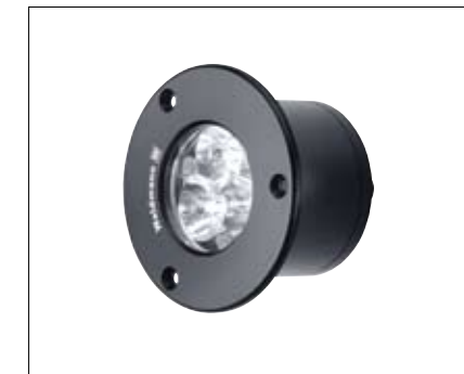
SPOT LED 003 RECESSED