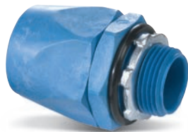
Type A Nonmetallic Liquidtight Connectors