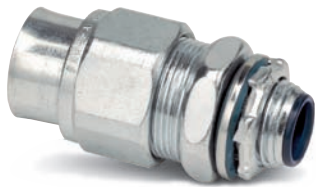
Type A Metallic Liquidtight Connectors